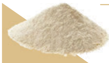
Whole wheat roll