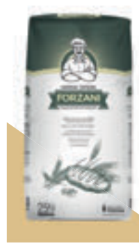
Dough Flour (tapera)